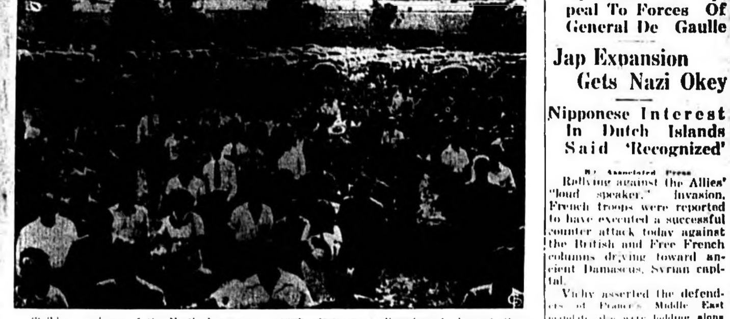
Striking employees of the North American Aviation Corp. and their wives attend the luncheon meeting in Inglewood, Calif., where they designated places of high union officials and government spokesmen that they return to work.

They Dared The Government To Take Over Plant