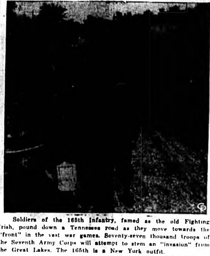
Soldiers of the 165th Infantry, famed as the old Fighting Irish, pound down a Tennessee road as they move towards the "front" in the vast war games. Seventy-seven thousand troops of the Seventh Army Corps will attempt to stem an "invasion" from the Great Lakes. The 165th is a New York outfit.