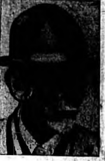
Daniel Carter Beard, known as "Uncle Dan" by millions of Boy Scouts, died today at the age of 60.

SUFFERN, N. Y., June 11—(AP)—Daniel Carter Beard, one of the founders of the Boy Scouts of America, died today.