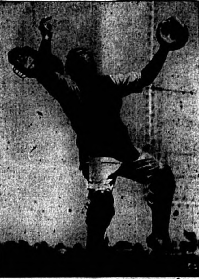
HE CATCHES and he hits—Joey Ernie Lombardi, Cincinnati Reds' catcher who hit top in National League batting