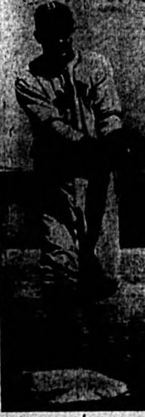
DODGERS' DAY in baseball world came when club hit winning streak, with Cookie Lavagetto doing bit for cause.