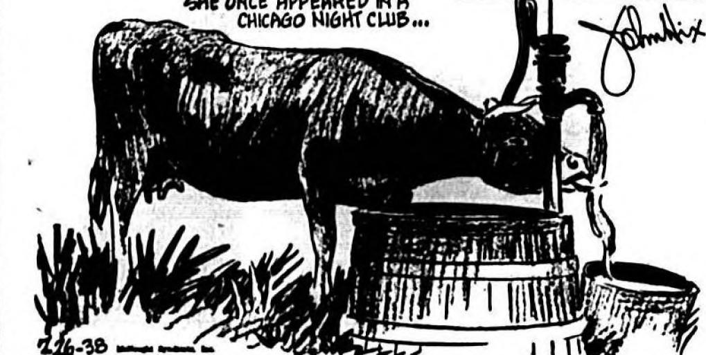
THE PUMPING COW... A downward loss of her head she works the handle to bring forth water.

GALILEO—famous astronomer—was AFRAID TO ANNOUNCE HIS DISCOVERY THAT THE PLANETS REVOLVE AROUND THE SUN! HE PUBLISHED HIS FINDINGS IN A COMPLEX LATIN CROSSWORD PUZZLE TO PREVENT RIDICULE...—17th century—