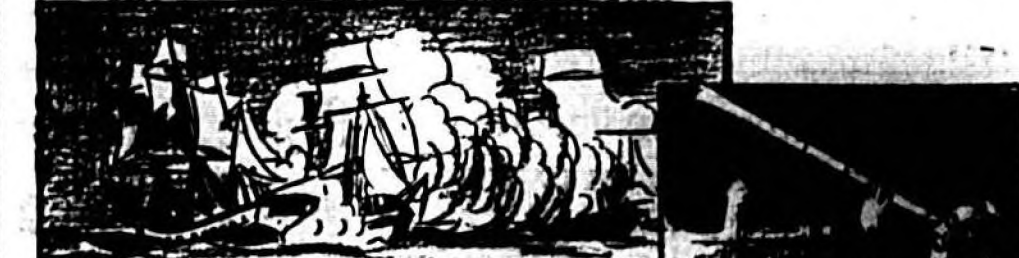
THE DECISIVE BATTLE OF PLATONBURG BAY, LAKE CHAMPLAIN, VT., WAS WON BY THE U.S. FROM THE BRITISH WITH A FLEET OF 14 SHIPS BUILT IN 40 DAYS!—Sept. 11, 1814—

For further proof address the author, indicating a stamped envelope for reply. Reg. U. S. Pat. Off.