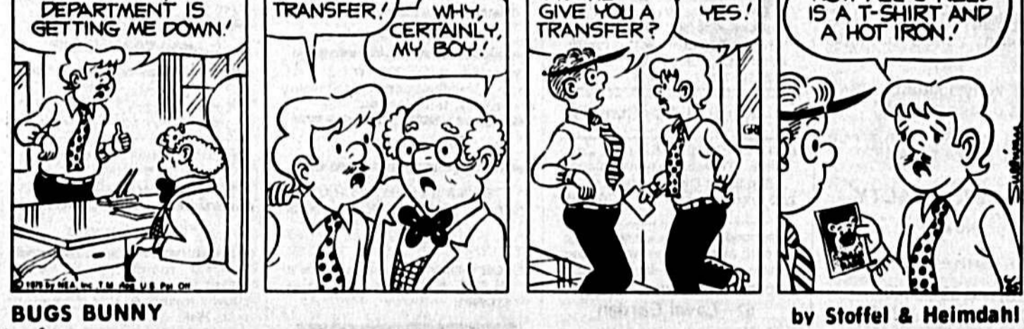
BUGS BUNNY by Stoffel & Heilmahl