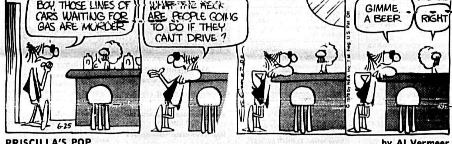
PRISCILLA'S POP by Al Vermeer