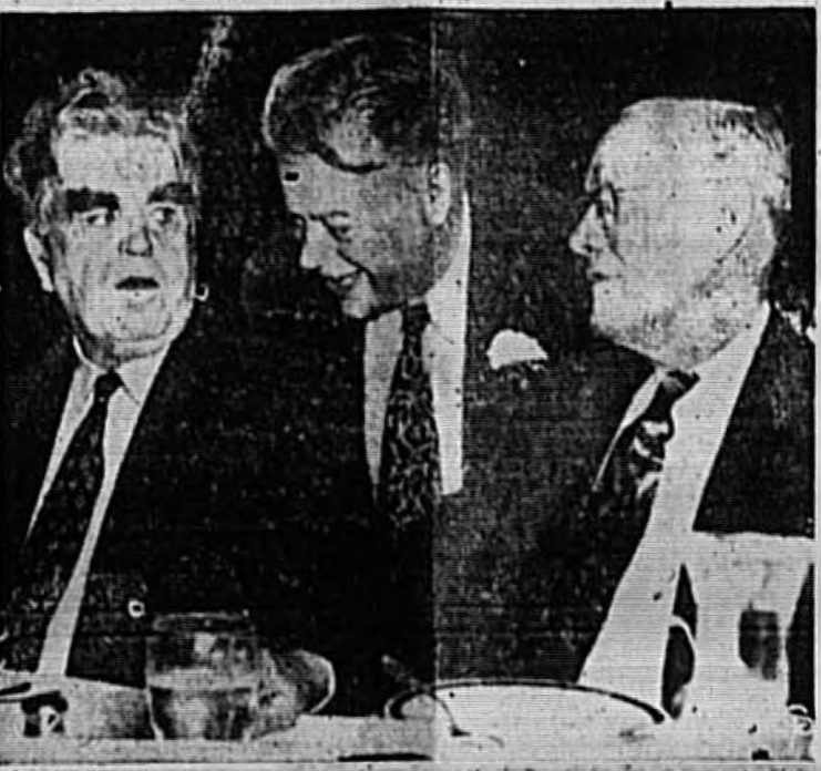
SOME OF THE NATION'S top labor leaders attended the testimonial dinner given at a Chicago hotel in honor of David Dubinsky (center), president of the International Ladies Garment Workers Union. Shown with Dubinsky are John L. Lewis (left), head of the United Mine Workers, and William Green, president of the A. F. L. (International)