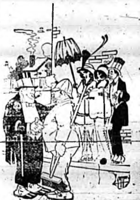
At the Lyric Monday, Sept. 23, "Bringing Up Father At Home" a Musical Comedy