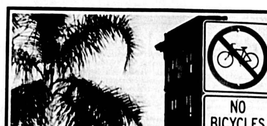
THREE-WHEELERS INCLUDED IN SANFORD ORDINANCE

The city of Casselberry may be filing suit against two investment companies to collect $870,000 the firms promised two months ago the city would save through a bond investment program which never came to pass.