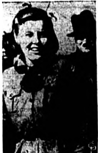
This Norwegian girl guide was one of the 1,000 refugees who voluntarily left Spitzbergen for England after British, Canadian and Free Norwegian forces raided the Spitzbergen Islands recently to prevent rich coal resources from being used by Nazis.

TALLAHASSEE, Sept. 19.—(Special)—Four student dietitians from the states of Pennsylvania, Illinois, Texas and Georgia have begun a nine-month training in administrative food work in the dining hall of Florida State College for Women.