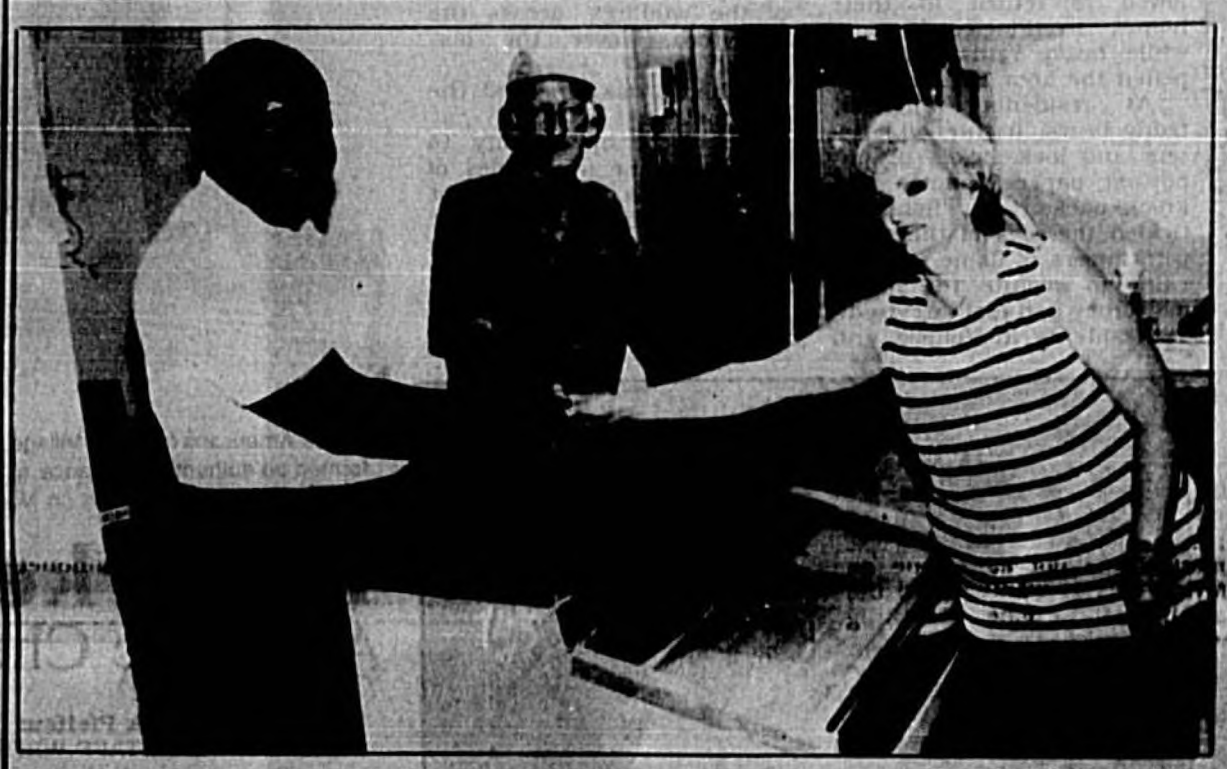
People helping people

Federal Trust Bank and Pines Hill Missionary Baptist Church joined forces and generosity to provide a much needed freezer to the Human Crisis Council of Sanford, 918 French Ave. Commemorating the do-