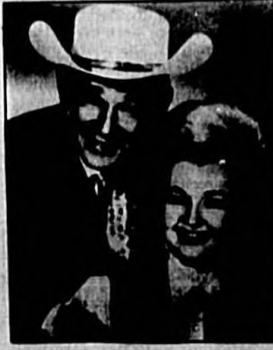
Roy Rogers, Dale Evans known as "the King of All Cowboys" comes to a close. Happy trails...

Rogers' son and Evans three children from previous marriages. It was Rogers who coined the phrase "The family that plays together and prays together, stays together". Rogers is survived by Evans, six children, one foster child, 15 grandchildren and 33 great-grandchildren. Rogers is preceded in death by his trusty steed, Trigger, who died in 1965. Rogers had the horse stuffed and mounted, and he is now on display at the Rogers' and Evans' museum. The two now trot into the sunset as the life of one of the great Western heroes (also