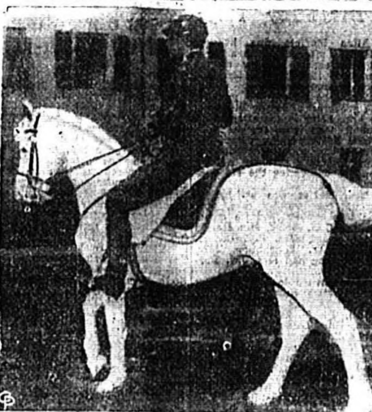
IF HE CAN'T BE IN TOKYO to ride Emperor Hirohito's white horse before Admiral Halsey does, General George S. Patton in Austria proves that he can at least ride a white horse that was to have been the emperor's. Here the Third Army commander is pictured on "Favori Africa," a thoroughbred picked by Hitler as a gift to be presented to Hirohito. This is a U. S. Army Signal Corps Radiophoto.