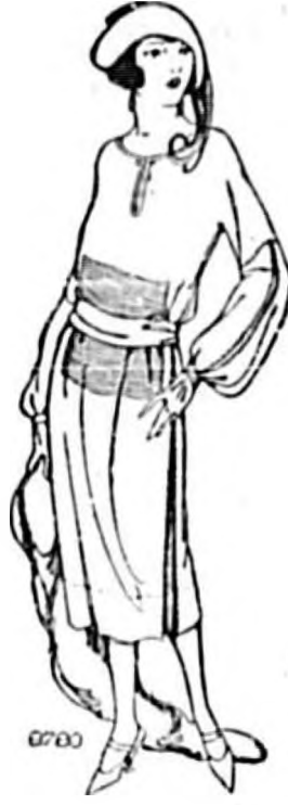
IN FOG-GRAY CRAPE

Dazzling in its simplicity is this frock of fog-gray satin crepe, trimmed with very narrow self-color braid. The front is slashed, then bound with a bias fold of self-material, while the sleeves are lengthened with deep, full cuffs that are gathered into narrow ribbon wristbands. Medium size requires 3 1/4 yards 40-inch material. Pictorial Review Dress No. 9780. Sizes, 34 to 46 bust. Price, 35 cents.