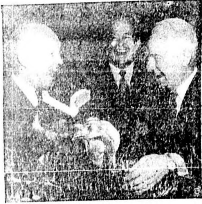
DWIGHT EISENHOWER laughs heartily as he reads recipes for cooking Thanksgiving turkey to a group gathered at the White House. The 43-pound bird appears to find little reason for mirth. President Eisenhower called it "the big bird" as the big bird has been named. It is being prepared tonight, president of the National Turkey Federation. A box of cranberries went with the gift.