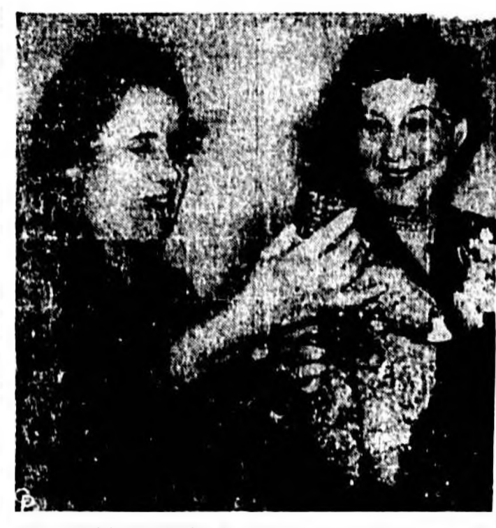
MRS. MAMIE EISENHOWER, wife of the President...