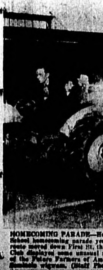
HOMECOMING PARADE —Here is one of the many floats that took part in the Seminole High School homecoming parade yesterday afternoon. Led by cars bearing various sponsors, the parade route moved down First St. through the heart of the business district. The high school band and Pep Club displayed some unusual marching arrangements. The pictured float, entered by the local chapter of the Future Farmers of America, depicts a Deland Baking tin to be used for baking before the homecoming program.