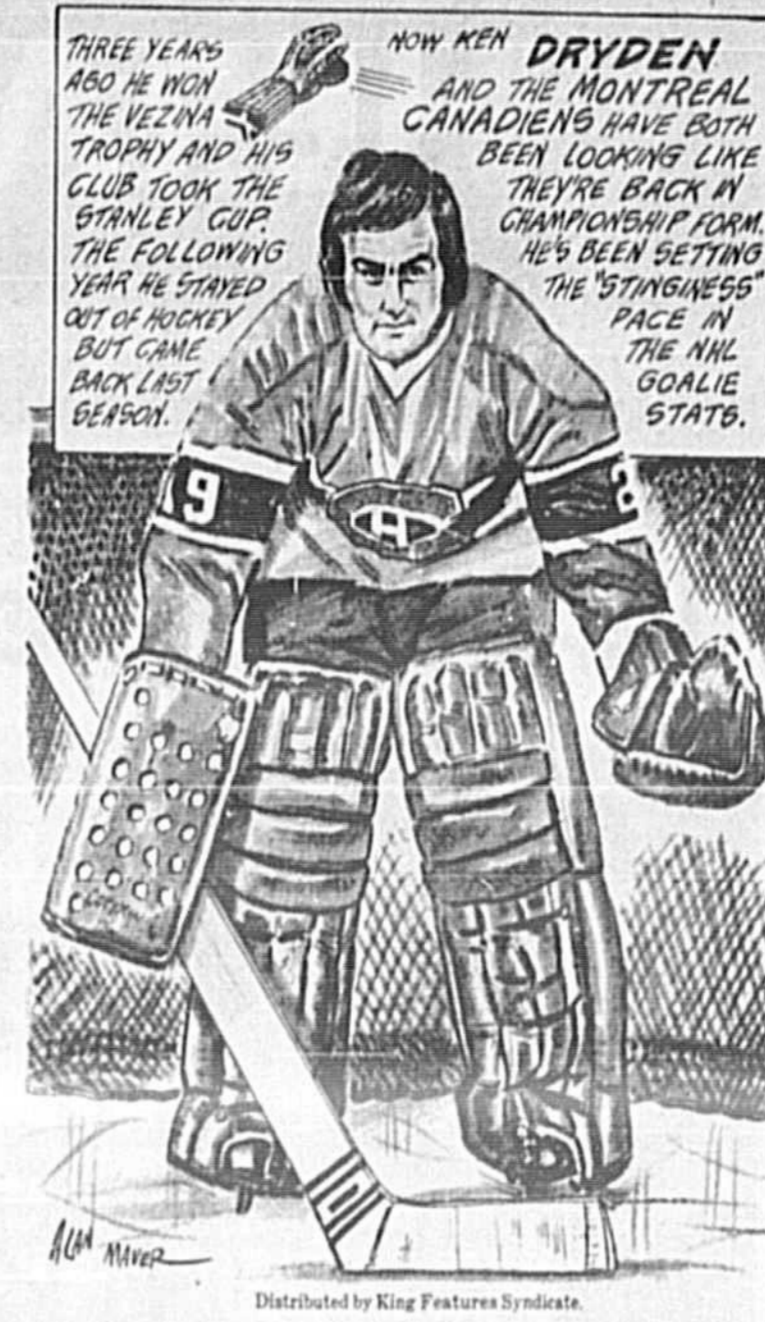
Illustration by Alan Moyer