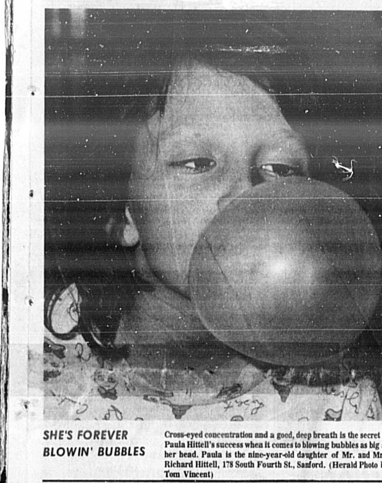
SHE'S FOREVER BLOWIN' BUBBLES