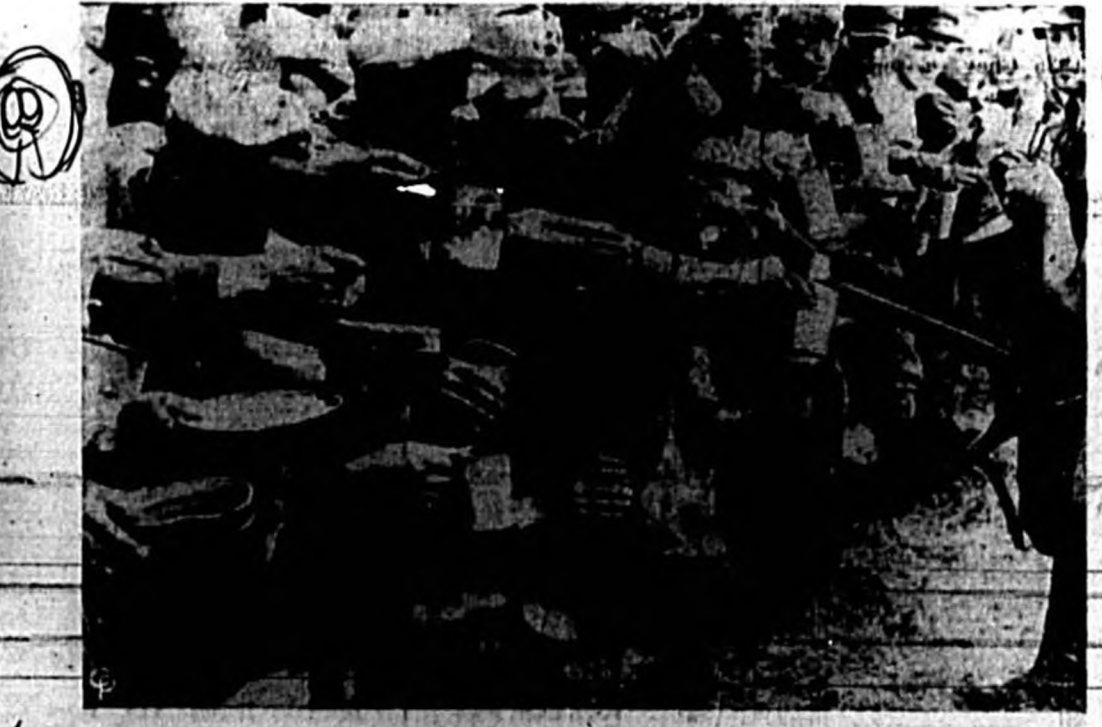
Thirsty, hungry and ragged, Red prisoners eagerly thrust empty cans and old containers through the barbed wire enclosure for water being doled out by a German guard in a Nazi prison camp in occupied Russia. The Soviet's scorched earth policy has made it difficult for the invaders to obtain supplies.