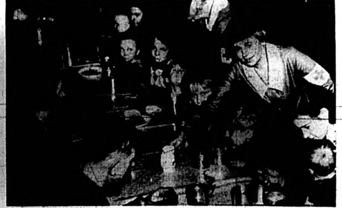
STANDS BY FOR EMERGENCY—Mass shelter and feeding are traditional American Red Cross responsibilities in time of disaster. Its plans are being adapted for use in civilian defense in event of a national emergency.