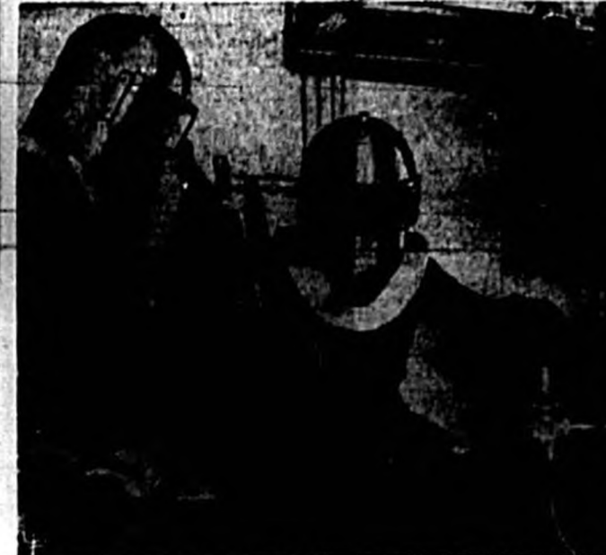
Douglas Aircraft workers, garbed in aluminum helmets and fleece-lined leather suits, test the hydraulic control system of a high altitude bomber in the new scientific "cold room" at the Santa Monica, Cal., plant. Effects of temperatures as low as 104 degrees below zero on planes and fliers will be determined here.