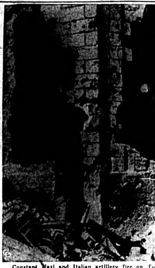
Constant Nazi and Italian artillery fire on Tobruk, Libya, is slowly knocking apart many of the structures there, but still the beleaguered city holds out. A soldier is shown crouching through a shell-battered wall at the figure of a saint in a church which has been hard hit.