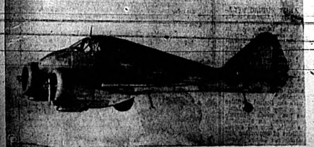
This is the latest trainer plane developed by the Curtiss-Wright Corporation at St. Louis for the army. Called the AT-9, it is an all-metal, low-wing monoplane equipped with retractable landing gear and accommodates a crew of two. Designed for the training of pilots for fast twin-engine fighters and bombers, the ship is ideally adapted to mass production.