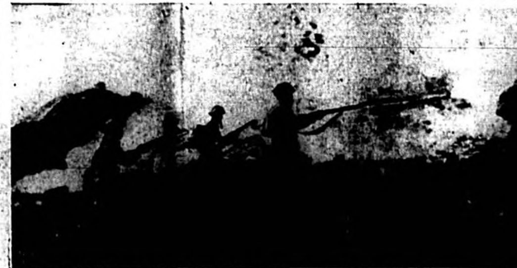
This photo, radioed from Moscow to London then to New York, gives a brief glimpse of grim hand-to-hand fighting on the Moscow front. The Soviet censor-approved caption states the Red soldiers are counter-attacking. One soldier is hurling a hand grenade.