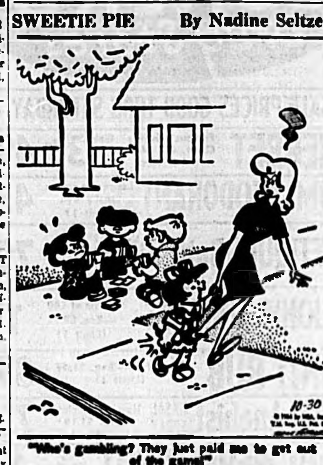
Who's gambling? They just paid me to get out of the game!