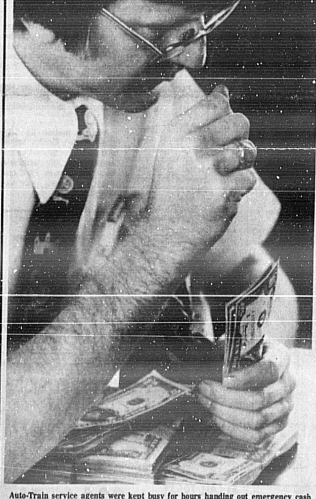
Auto-Train service agents were kept busy for hours handing out emergency cash allowances to passengers whose cars were damaged in the accident.