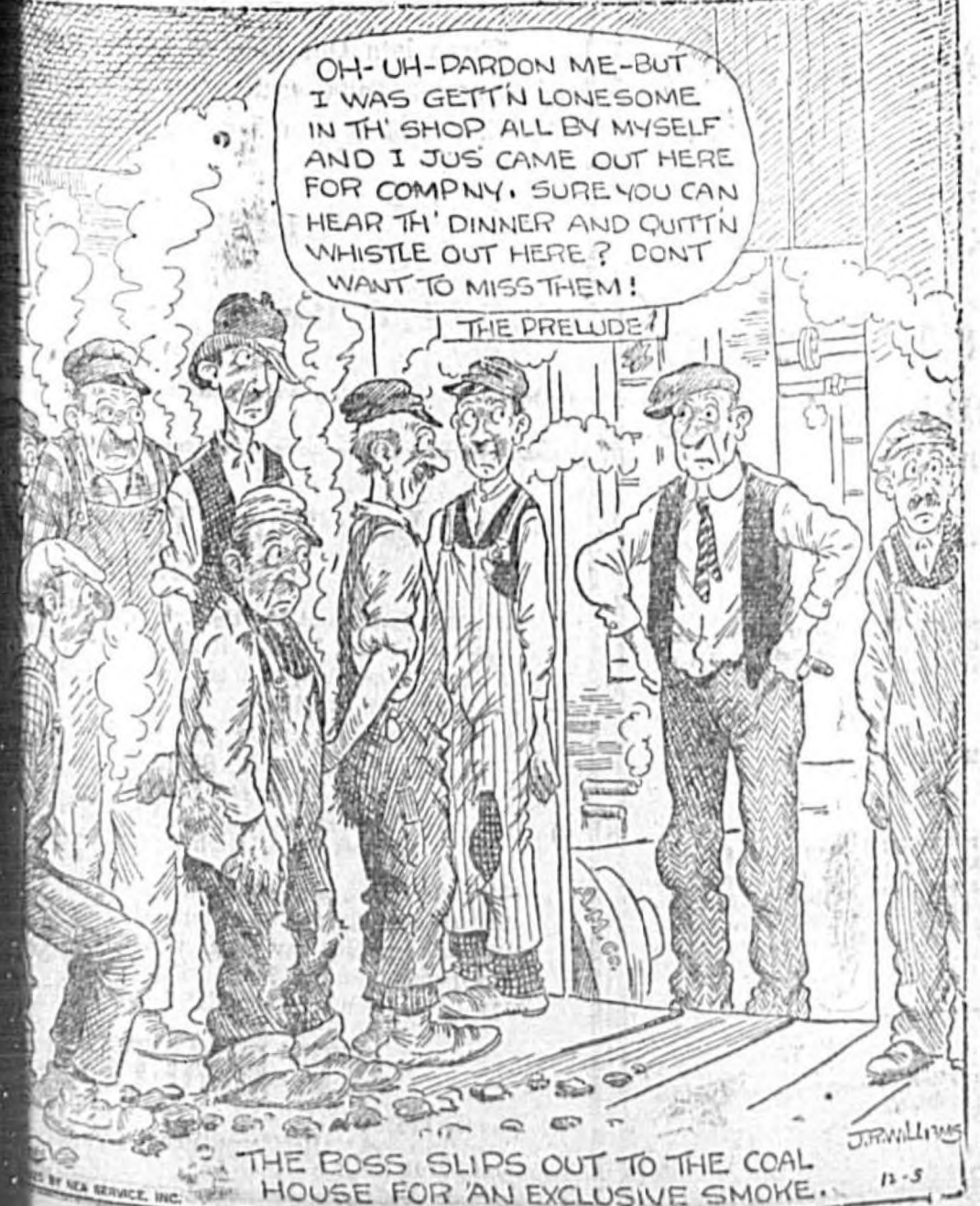
THE BOSS SLIPS OUT TO THE COAL HOUSE FOR AN EXCLUSIVE SMOKE.

SALES AGENTS 202 FIRST STREET PHONE 735 MASONIC TEMPLE