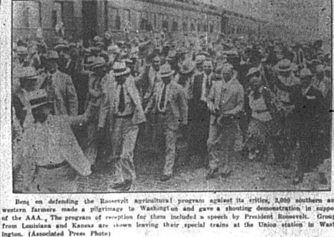
Farmers on their way to Washington to defend the Agricultural Adjustment Act. They are shown leaving their special trains at the Union station in Washington.