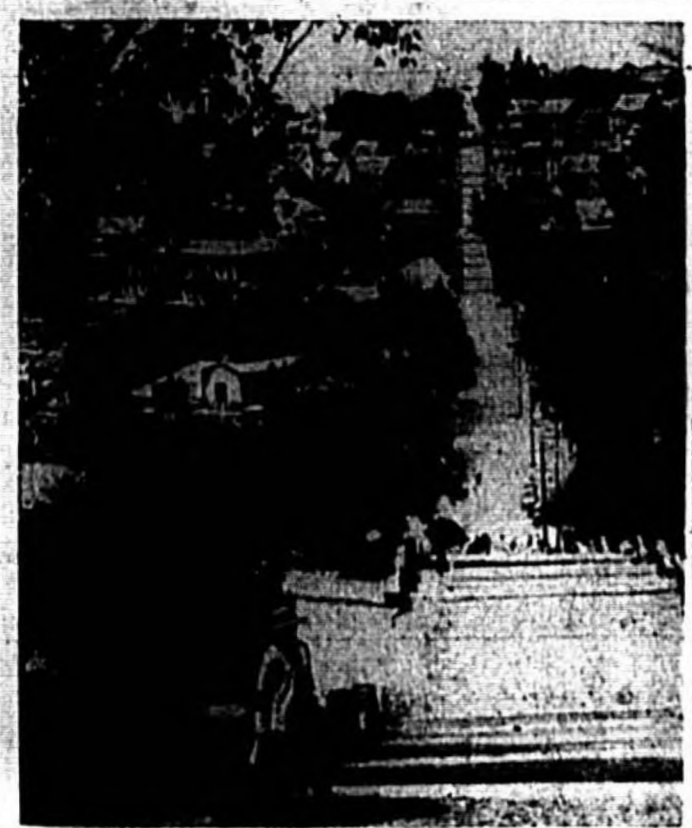
Stealing a march on the Japs, British forces secured the strategic French island of Madagascar. Shown above is a view of the capital, the city of Tananarive, which has a population of 100,000. The U. S. State Department announced that, if necessary, American forces would be sent to the island against all comers.