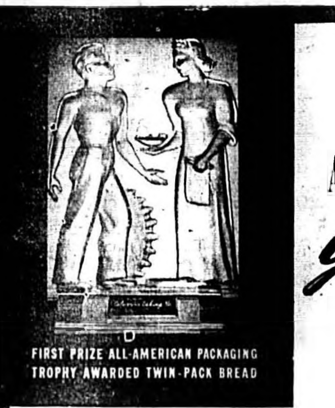
FIRST PRIZE ALL-AMERICAN PACKAGING TROPHY AWARDED TWIN-PACK BREAD