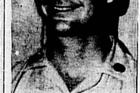
Know Your Fireman