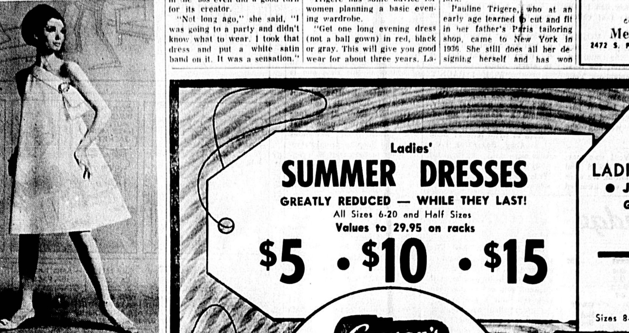
FROM THE TRIGERE fall '66 collection come these two timeless creations. Cape with Mephistopheles collar (left) in wool is worn over American Gothic hand-filled green and gold paillettes-embrodered evening dress. The shoulder belt of this full-skirted suit is given (right) exposed one bare shoulder. In lieu of buckle on the shoulder, a miniature coronet of precious stones is used.