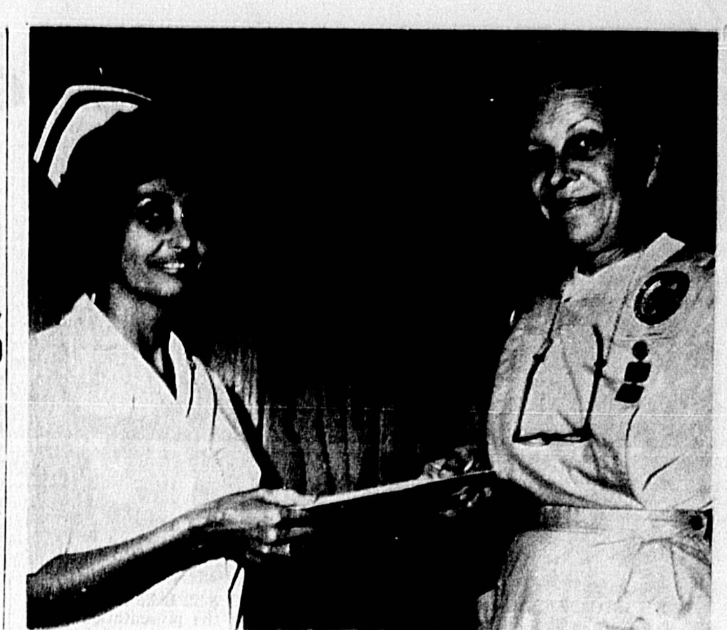
LATEST EQUIPMENT for care of heart patients is being purchased for Seminole Memorial Hospital's intensive care unit by the Pink Ladies Auxiliary.