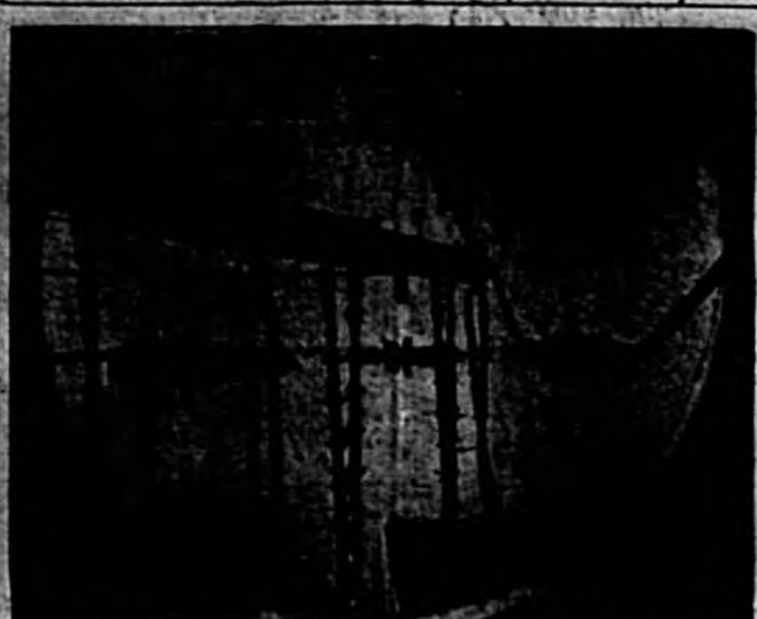
Finland's tiny navy has given good account of itself in the early days of war, according to reports of engagements with Soviet warships. Above, Finnish ships in the Gulf of Finland seen through the periscope of another war vessel.