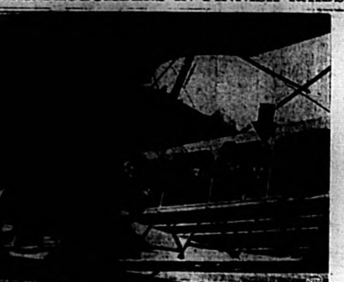
Soviet women of war fighting and dying for Russia in the invasion of Finland, according to reports from Helsinki where a female pilot was said to be among Red flyers shot down during a bombing raid. Squad of Soviet air warriors above includes woman, indicated by arrow. It is estimated at least 500 women are in the Russian air force.