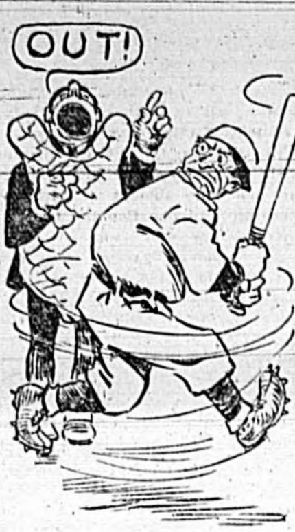
The jack of all trades is somewhat in excess of the jack that goes with a white collar job.