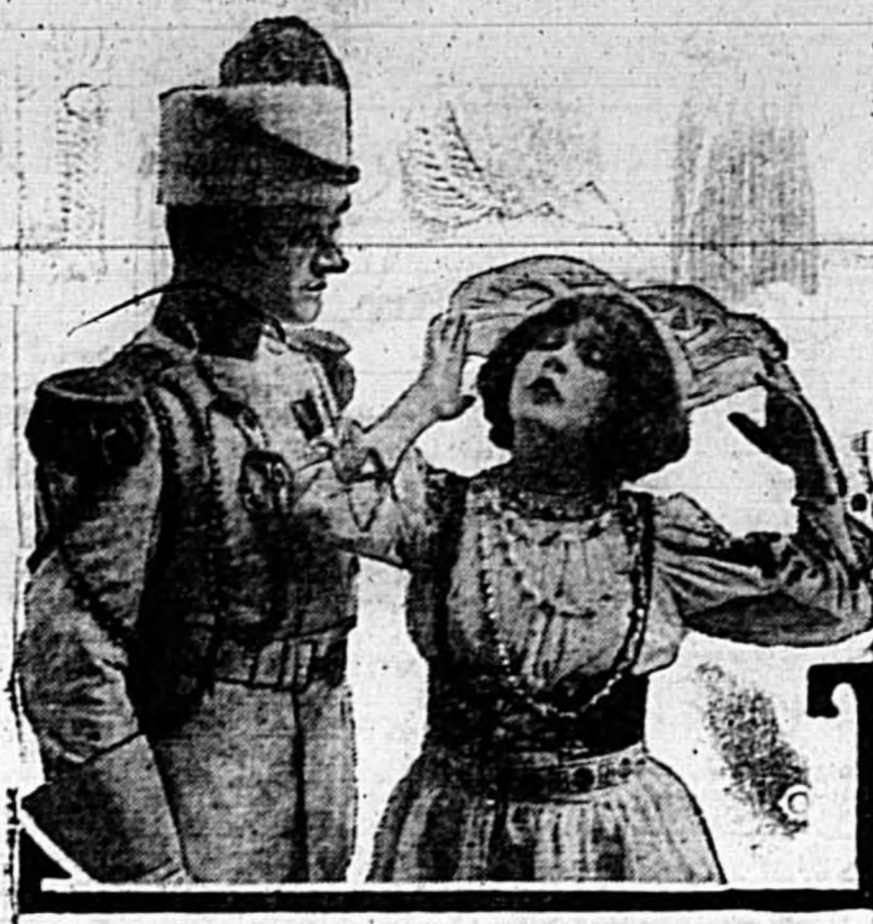
MAE MURRAY in a Scene from "JAZZMAMA" AT THE PRINCESS TONIGHT AND TOMORROW

The Herald delivered six times a week for 15c.