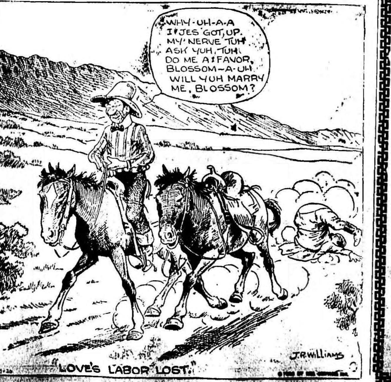
LOVE'S LABOR LOST.