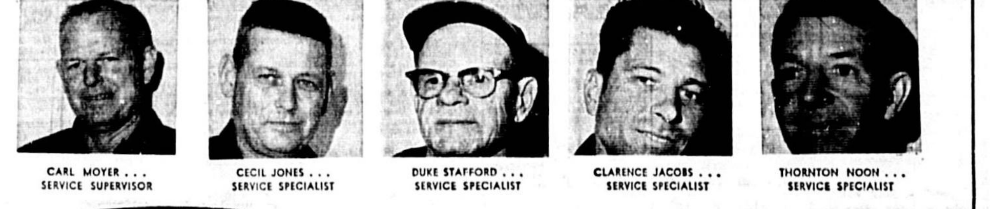
Meet our capable service crew... 87 years of total experience!