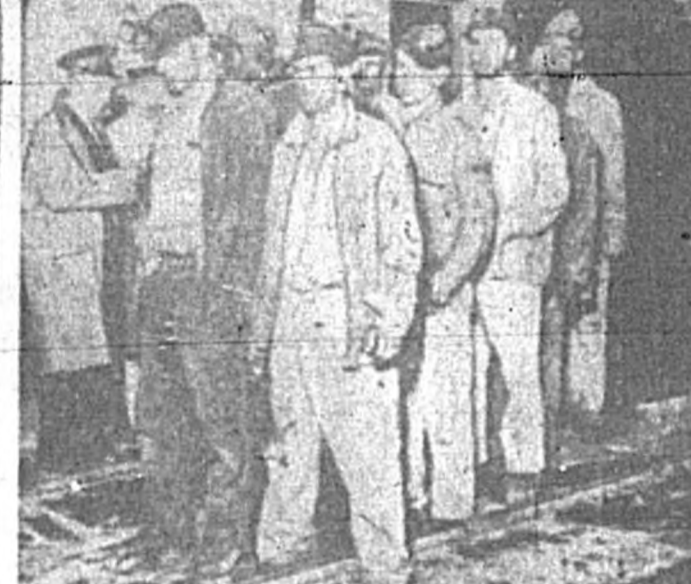
Convicts who were revolting in the state penitentiary at Joplin, Mo., surrendered to the state police today.