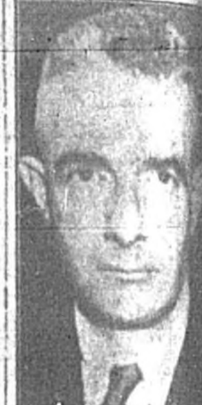
Charging "starting" a riot, the state police today suspended from duty a member of the state police.