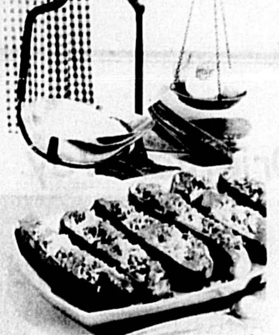
STUFFING MAKES ZUCCHINI SPECIAL