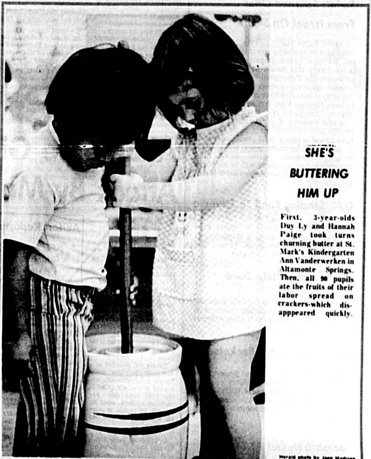
SHE'S BUTTERING HIM UP