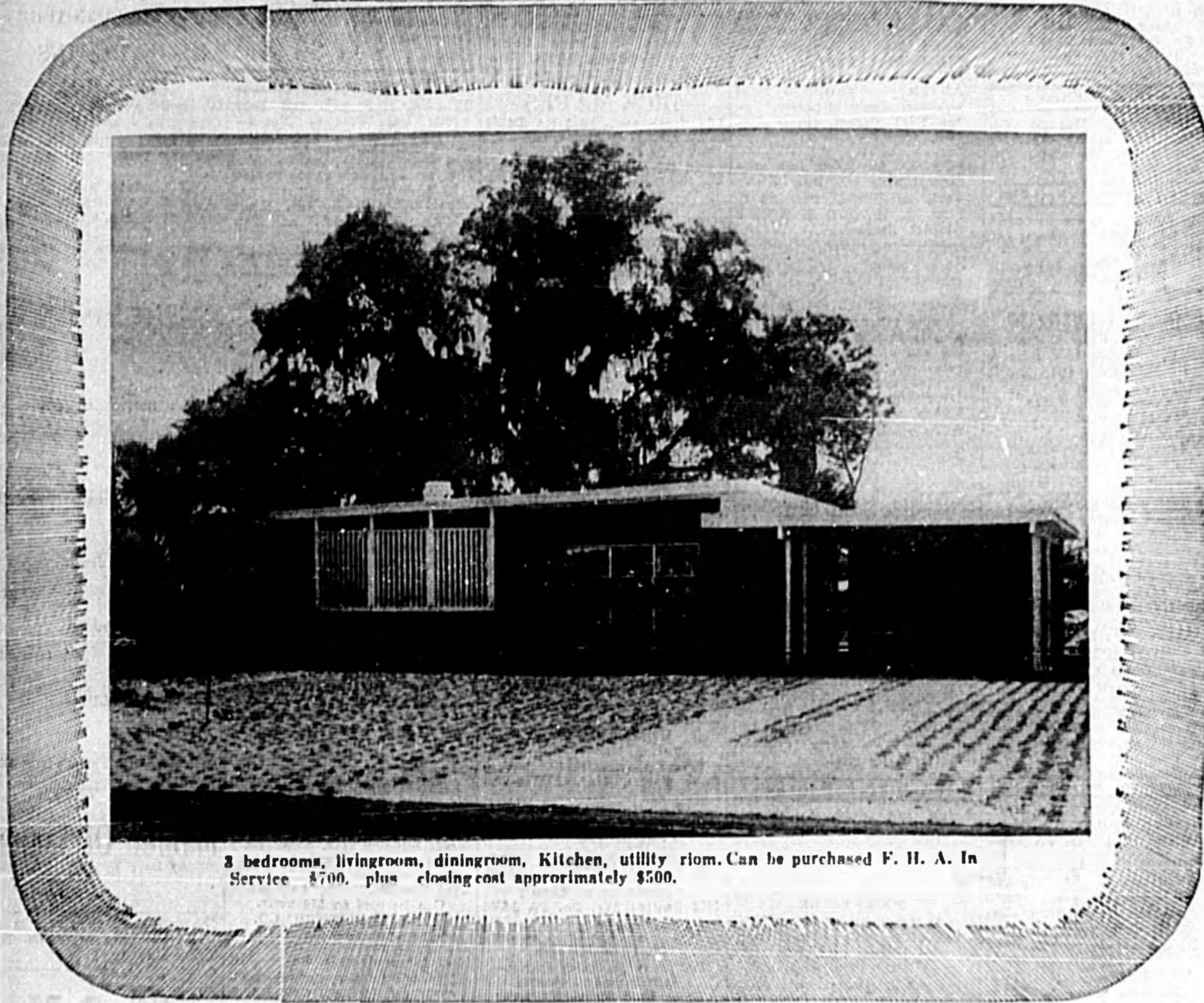
3 bedrooms, livingroom, diningroom, Kitchen, utility room. Can be purchased F. H. A. In Service $700. plus closing cost approximately $500.