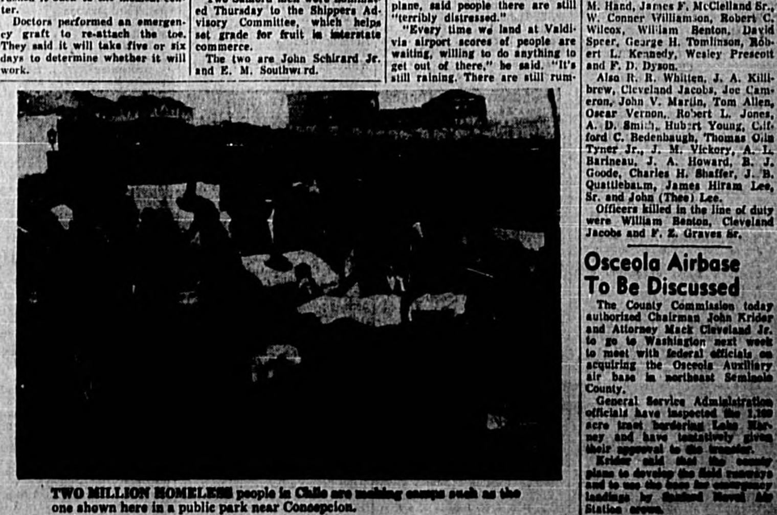
TWO MILLION HOMELESS people in Chile are waiting camps such as the one shown here in a public park near Concepcion.