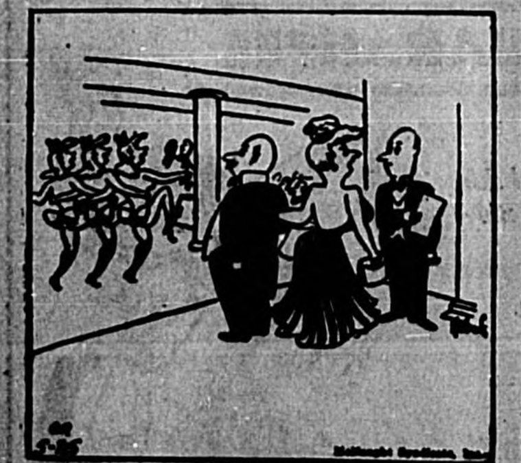
"And one seat behind the post"