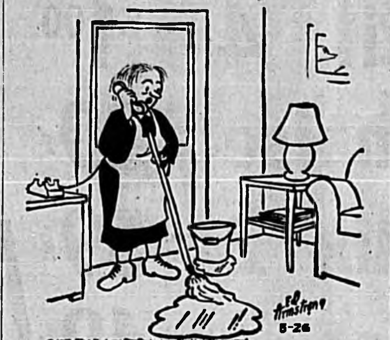
"As I said before, the doctor leaves at six, but you try that oatmeal poultice and check back with me tomorrow night."

15. Special Services AIR CONDITIONING H. B. POPE CO. 200 S. Park FA 2-4234