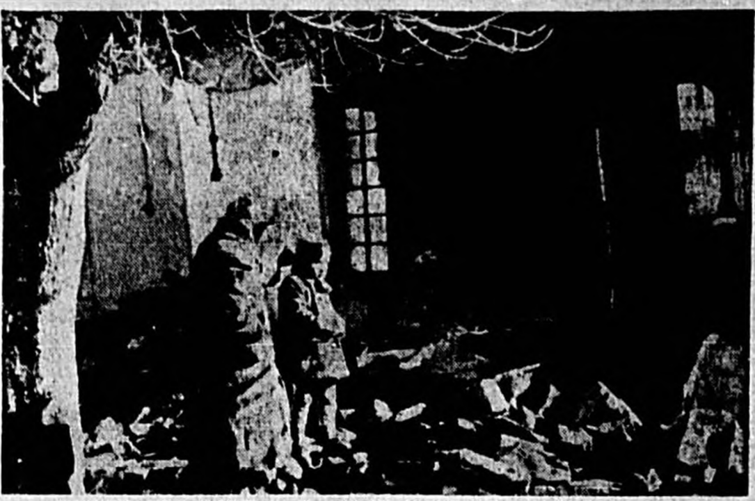
MOTHER AND CHILD stand amid debris of their home which was ruined by one of the earthquakes striking the city of Concepcion, Chile.

SANTIAGO, Chile (UPI) — President Jorge Alessandri instituted price controls today to prevent profiteering in quake-damaged areas south of Chile where more than 5,100 persons were reported dead or missing.