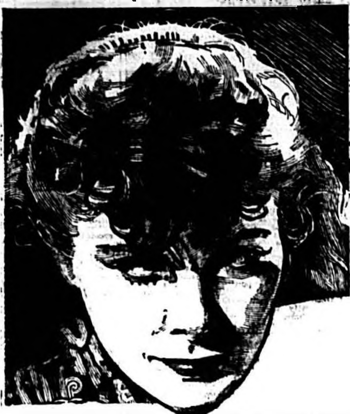
Playing "Jo" in "Little Women", the marvelous Katharine Hepburn, whose screen career has been a mounting blaze of glory, appears in her fourth RKO Radio Picture, which is based upon the Louisa M. Alcott classic playing at the Milane Sunday, Monday and Tuesday.