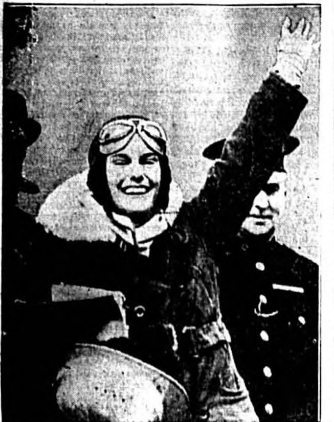
PERNAMBUCO, Brazil, Nov. 14.—(AP)—Jean Batten, 29-year-old New Zealand flyer, landed at Natal, Brazil, after a 10-hour flight of 13 hours across the South Atlantic from Natal, Senegal, Miss. Batten thus became the first woman to fly non-stop across the South Atlantic.