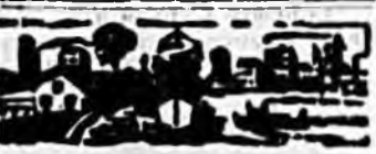
CITY NEWS BRIEFS

School Superintendent Explains Needs At County Council Session Of Parent-Teachers' Association