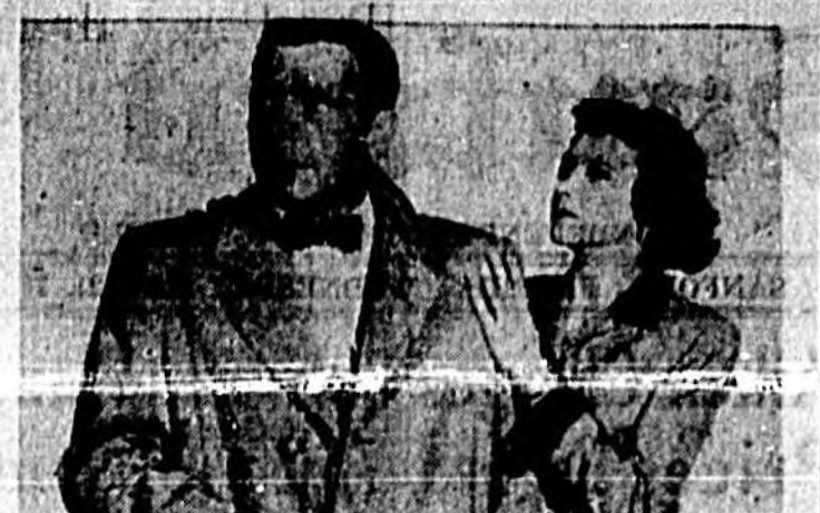
Two Academy Award Winners — Humphrey Bogart and Kim Hunter in a scene from 20th Century-Fox's "Deadline—U.S.A." showing in the Rita Theater screen Thursday and Friday.