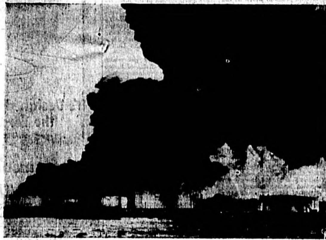
A view of the raging fire sweeping the Southwestern Tank and Oil Refinery plant at Corpus Christi, Texas. The fire is believed to have started in a tank farm in the city's industrial center. Military and civilian workers evacuated an estimated 600 families from the vicinity of the plant. Fire fighters were concentrating on preventing the fire from reaching high octane gasoline storage tanks. Eight firemen were injured before the fire was brought under control.

He Will Be Grateful For Your Continued Support.