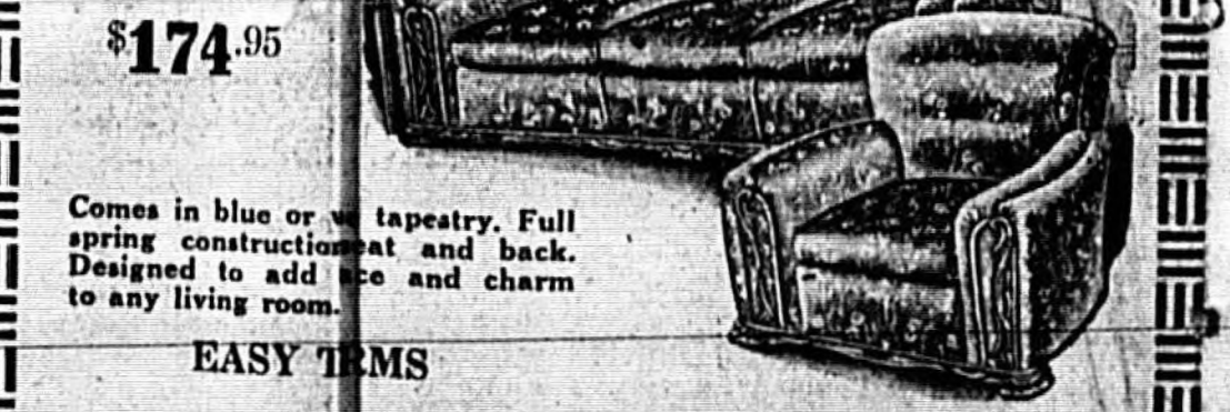
TWO PIECE LIVING ROOM SUITE $174.95 Comes in blue or w. tapestry. Full spring construction at and back. Designed to add grace and charm to any living room.

EASY TERMS "IT'S EASY TO PAY THE WAY" MATHER MATHER OF SANFORD 203-09 E. 1st Phone 127