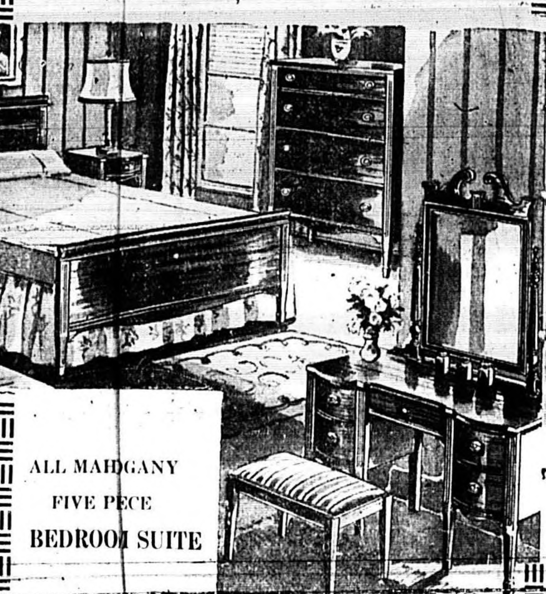
ALL MAHOGANY FIVE PECE BEDROOM SUITE Designed for beauty, comfort and distinctive elegance. This suite consists of vanity, vanity bench, full-size bed, large 5-drawer chest and night stand. $179.95

YES! MATHER'S PRICES ARE BELOW THE OLD OPA APPROVED PRICES. And you can count on it that we will continue to hold these prices as long as stock lasts. . . . continuing our long established policy of giving you the very best furniture obtainable at the lowest possible price.