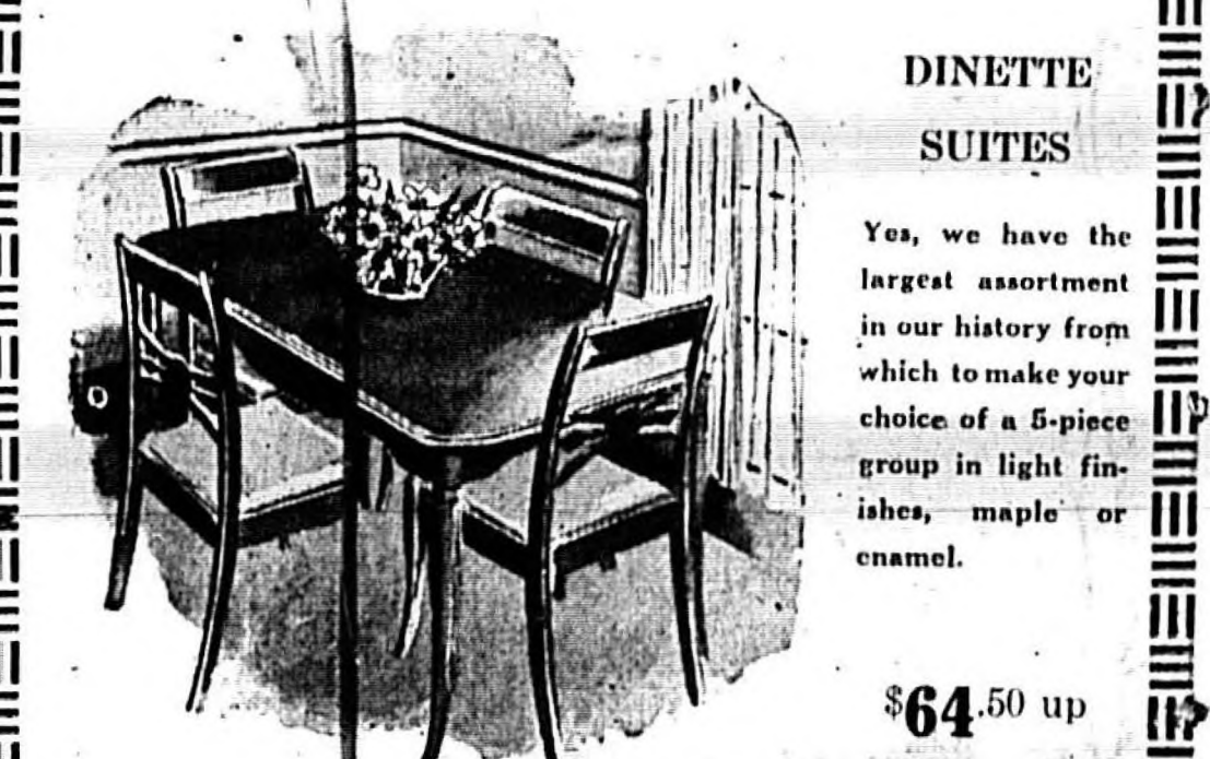
DINETTE SUITES Yes, we have the largest assortment in our history from which to make your choice of a 5-piece group in light finishes, maple or enamel. $64.50 up