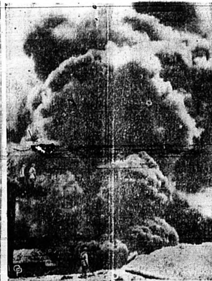
UNDER THE SUPERVISION of 70 GIs, German laborers are destroying some 85,000 tons of Nazi poison gases. Three workers, wearing decontamination suits, are shown watching burning mustard gas as it sends up huge billows of smoke at the Chemical Warfare Service depot at St. Gerogen, Germany. A layer of chloride of lime placed in the burning pit sends the mustard gas into flames immediately.

ment in enabling the United States to safeguard all military naval and airbases it may desire permanently to establish here. As president of the Philippines, I will arrange the defense of these islands that it may be intimately coordinated with the plan of the United States for the maintenance of defensive bases in the Philippines. We will maintain as large an army as our resources permit and it will cooperate very closely with the armed forces of the United States based in the Philippines. Also, I am committed with respect to the influx of American capital in the Philippines. After the destruction we have suffered, diplo-