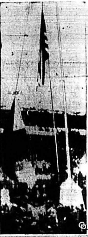
THIS RADIOPHOTO which was...