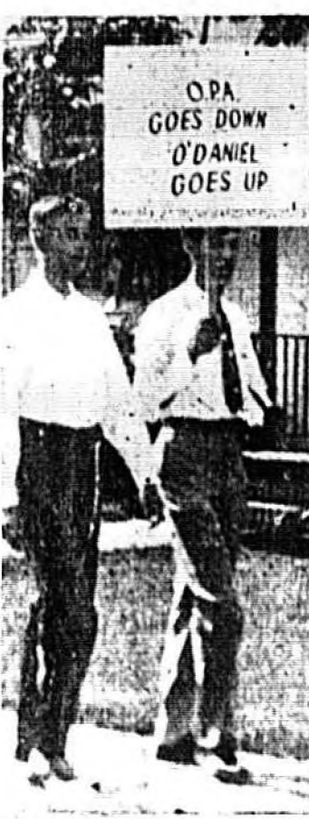
A GROUP of members of the...

Body Urged By Sen. Barkley To Revive Price Controls As Soon As Possible