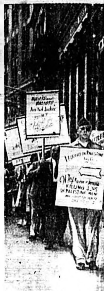
HEADED by a veteran of World War I, members of the American Zionist Emergency Council are shown as they picketed the British Consulate in New York City. They are carrying placards denouncing the British policy in Palestine.