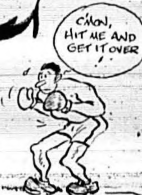
THE RESULT WILL BE THE SAME WHETHER IT'S OMA, MAURELLO OR WOLCOTT