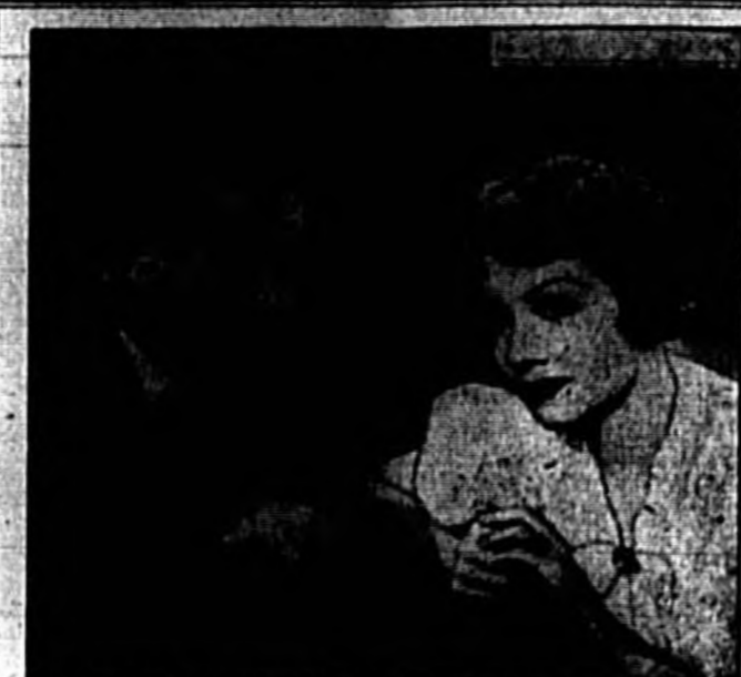
John Payne and Claudette Colbert are shown here reminiscing over old times in their latest picture, "Remember the Day," a love story that defied the world, which will be shown at the Ritz Theatre tomorrow and Thursday.