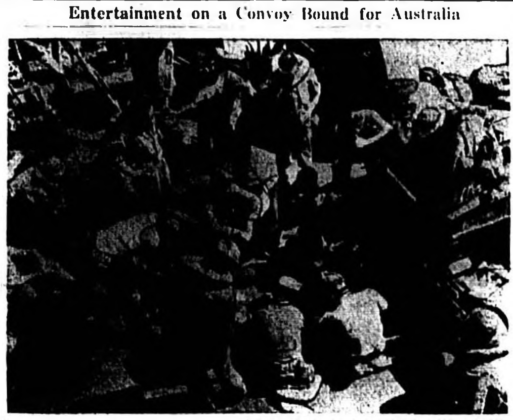
Wearing lifejackets, U. S. soldiers en route to Australia while away the time with a game of cards. The War Department has announced men and material in great quantities have arrived safely in Australia where Gen. Douglas MacArthur is now in command.