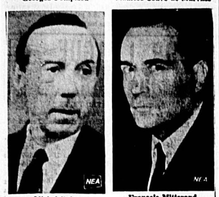
Michel Debre LIKELIEST candidate to succeed Charles de Gaulle as president of France is believed to be former Premier Georges Pompidou.