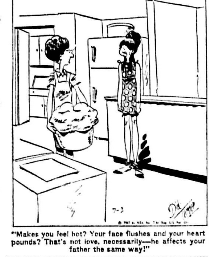
"Makes you feel hot? Your face flushes and your heart pounds? That's not love, necessarily—it affects your father the same way!"