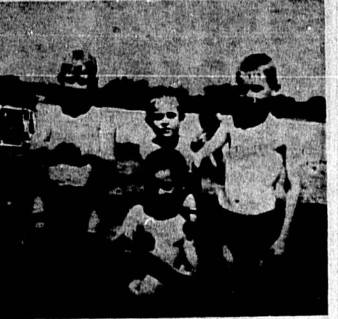
SCORES OF kids enjoyed the "Tom Sawyer" Day by scouts of Cub Park 548 recently at Silver Lake.