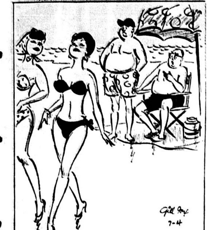
"I tell you ONE thing that's wrong with the world: Girls don't know how to flirt any more!"