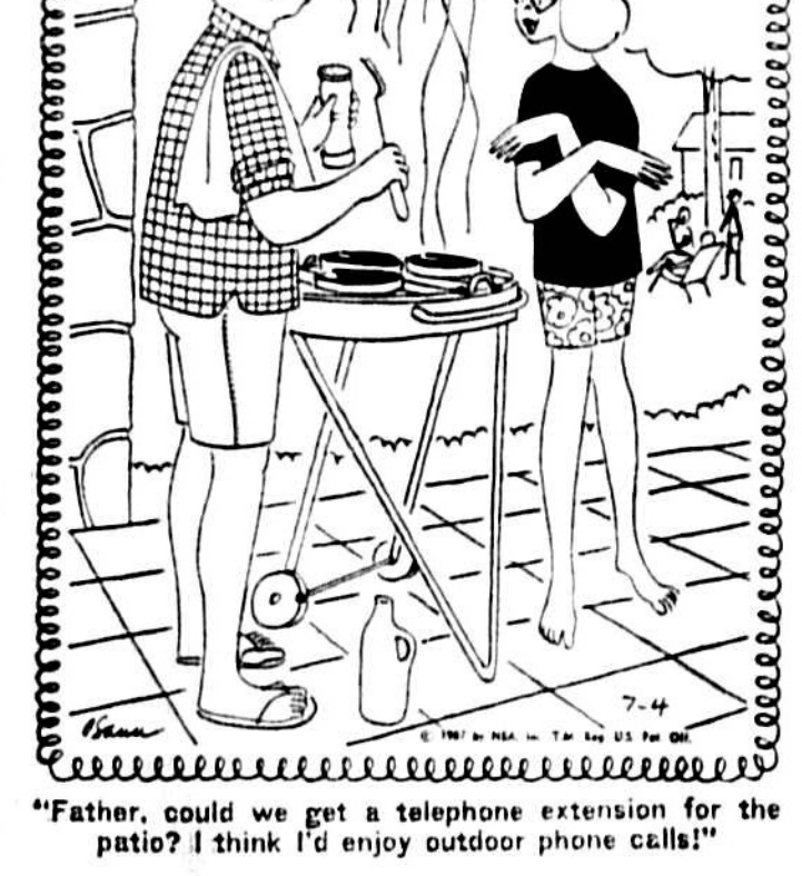
"Father, could we get a telephone extension for the patio? I think I'd enjoy outdoor phone calls!"