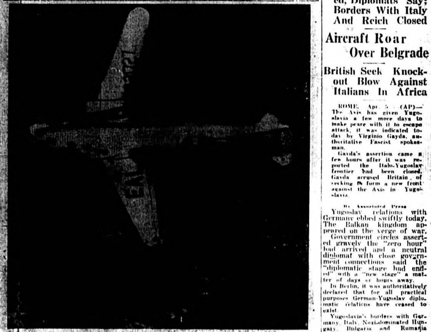
The Eastern Airlines plane lost for hours with sixteen persons aboard is shown in the swamp, 10 miles from Vero Beach, where the pilot brought it down. None of the plane's occupants was critically injured. Arrow shows one of the wheels from the damaged undercarriage. The plane was enroute from Miami to New York when it flew into a storm.