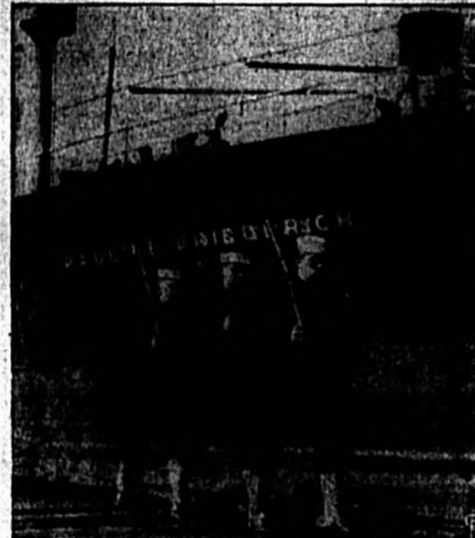
Coast Guardmen keep a careful watch on the German freighter Pommern in Boston harbor to prevent sabotage. Five ships were grabbed in the harbor in the nation-wide seizure of axis vessels.