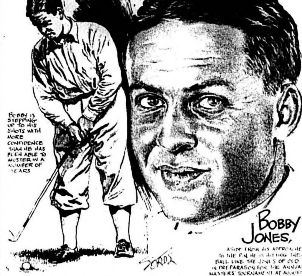
BOBBY JONES, ANY LOCALS APPROACHES TO THE PALM IS DETRIMENTAL TO HIS GAME. HE IS IN PREPARATION FOR THE ANNUAL MASTERS TOURNAMENT AT AUGUSTA.