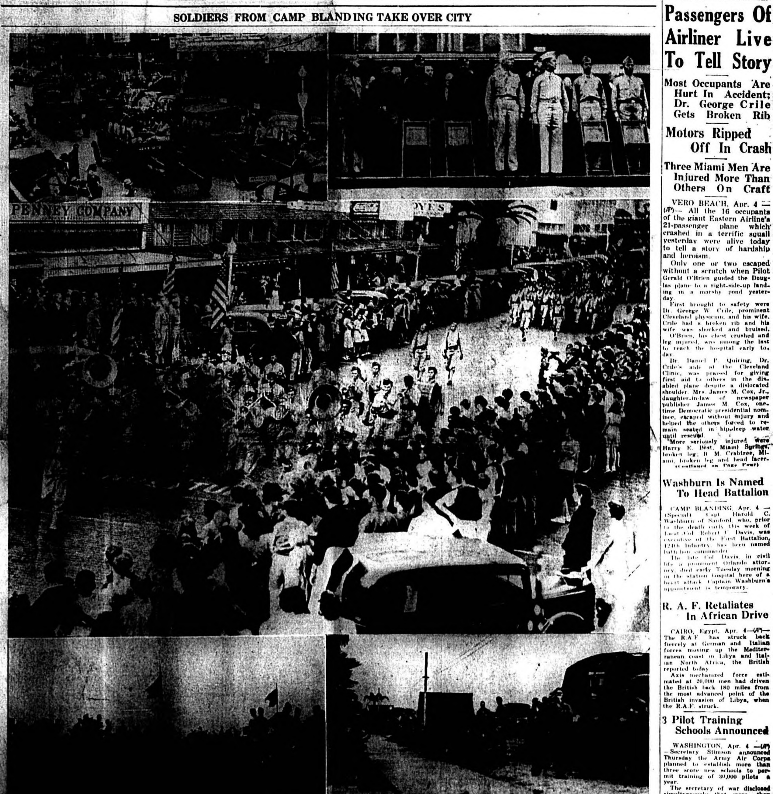
SOLDIERS FROM CAMP BLANDING TAKE OVER CITY