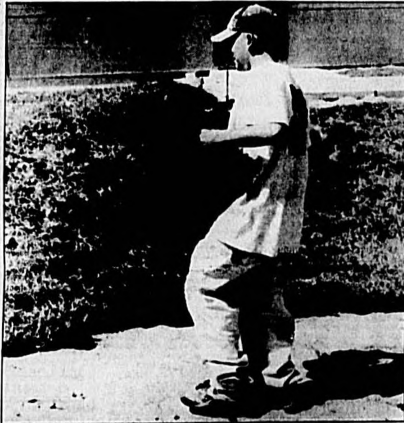
In laying sod.