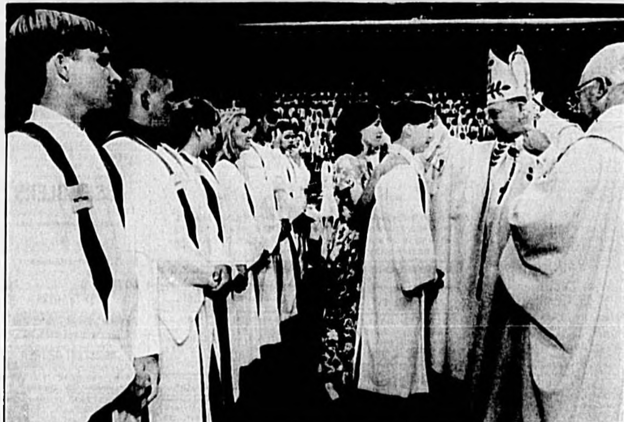
Some of the Catholic candidates confirmed

In the Roman Catholic Church, confirmation is considered to be one of the seven sacraments instituted by Jesus Christ. The sacraments of initiation are baptism, confirma-