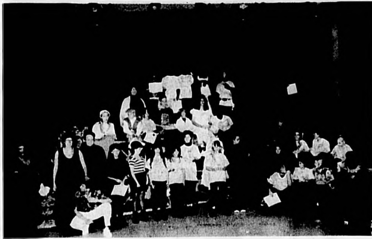
Members of Tajiri Arts gather onstage before a performance.