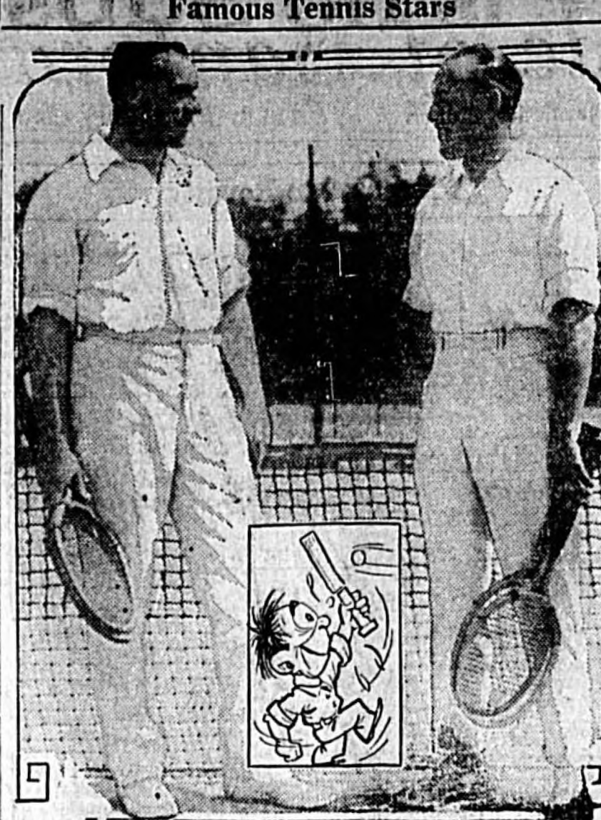
These two famous Australian tennis players are now competing in various tournaments in this country. The one on the left is Gerald Patterson, the other Jack Hawkes. Both of them are well known on this side of the Atlantic, Patterson especially, for his Davis Cup play.