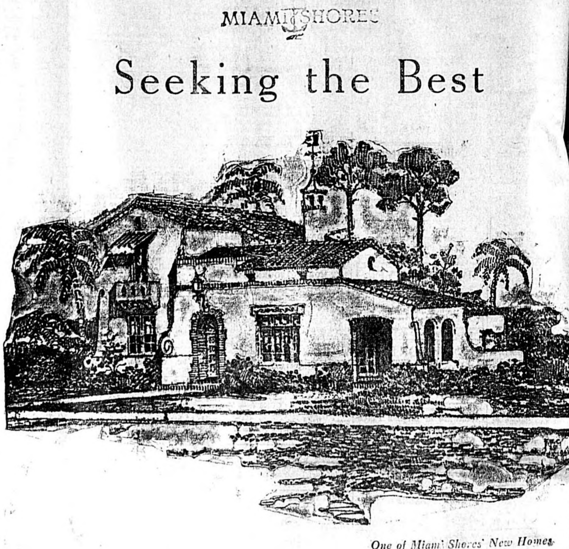
One of Miami Shores' New Homes.