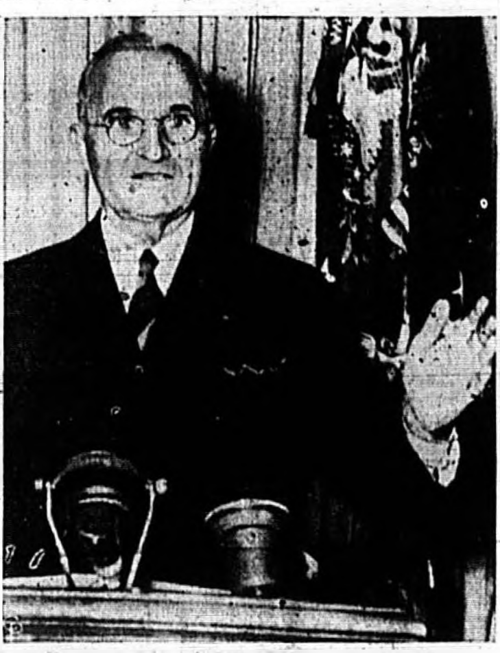
PRESIDENT Harry S. Truman, in a radio address from the White House, tells the nation that he has ordered removal of government price controls from meat, livestock, feed and all foods derived from livestock. The President said this action was the only remedy left to cure the meat shortage, and was taken after deep thought.