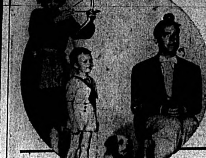
THIS is just play acting for in real life Dick Powell and Joan Blondie are Mr. and Mrs. but in their latest picture, 'I Want a Divorce', they are at the Ritz Theater next Tuesday, they are at it with a hammer and tongs.