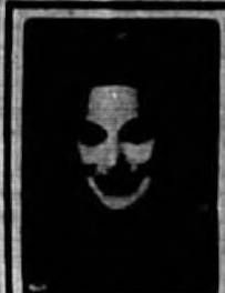
ADVISE ABIGAIL VAN BUREN