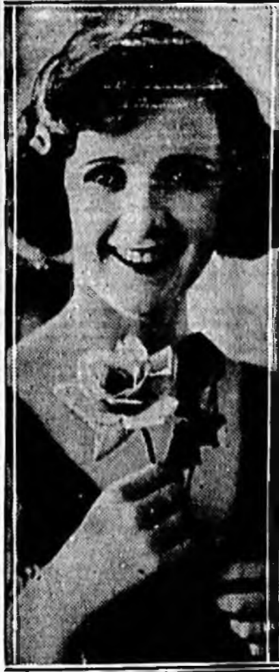
Constance Talmadge has gone to California to make pictures, since California has more agreeable winters than New York. She will visit sister Natalie, who is Mrs. Buster Keaton.