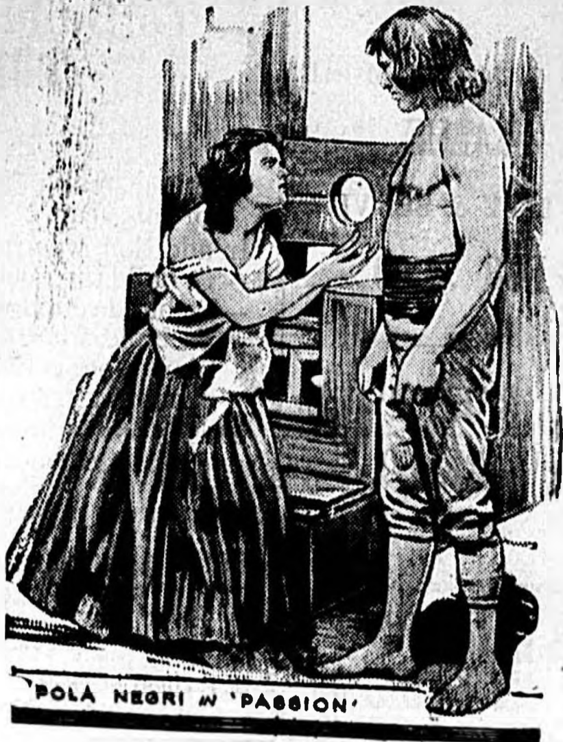
Pala Negri in "Passion" at the Star Tonight