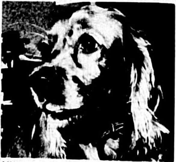
AIN'T SHE SWEET...? Sweetie, a cocher spaniel, is just one of the animals looking for a home at the Humane Society of Seminole County. For information on animals available for adoption phone 323-9665.

The dinner was also attended by the Women's Club Board of Managers (both senior and junior clubs).