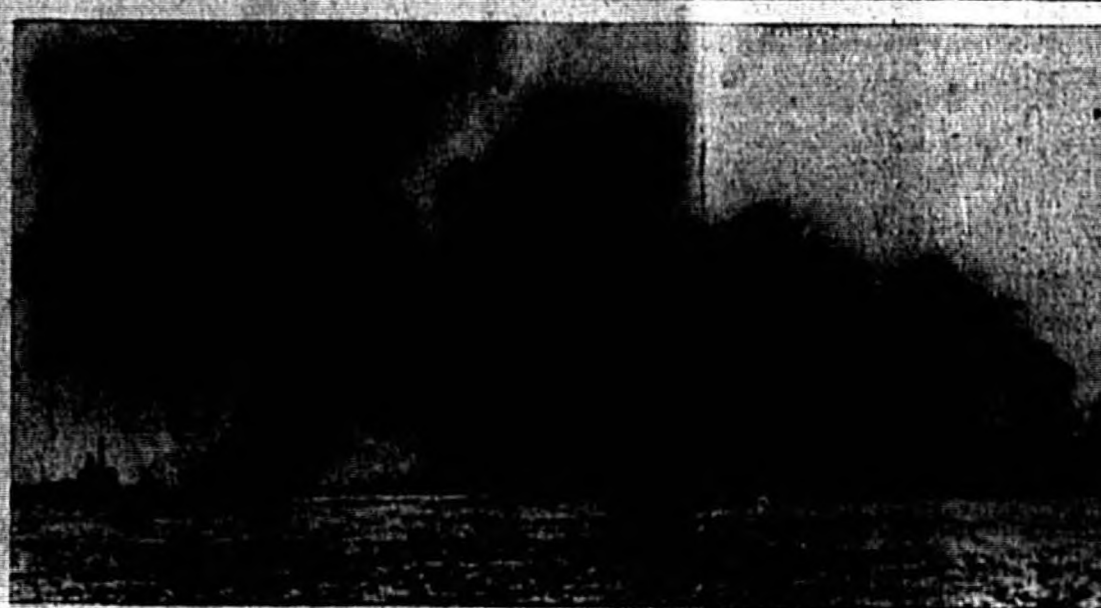
This photo shows smoke pouring from the U.S. Navy transport Wakefield, the former luxury liner Manhattan, ablaze at sea after fire of undetermined origin struck the $10,000,000 vessel. Note the destroyer sailing off with some of the 1,600 passengers and crewmen of the burning ship. The hull of the vessel has been salvaged and towed to an Atlantic port.