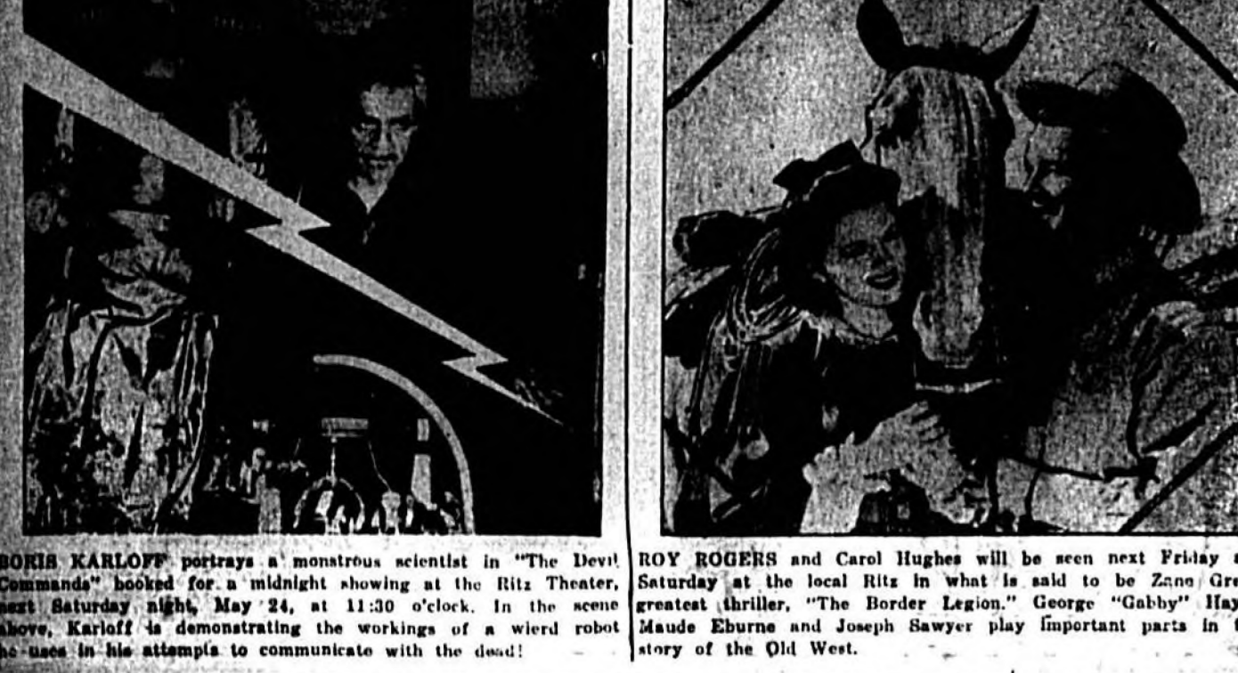
DOIR KARLOFF portrays a notorious scientist in 'The Devil Commands'...