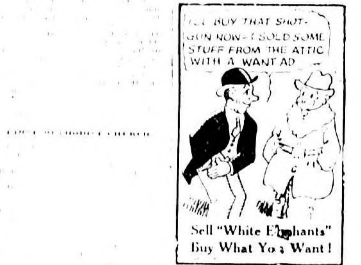
Sell 'White Elephants' Buy What You Want!

NEW ARRIVALS... A large shipment of new arrivals has just come in, including a variety of styles in dresses, blouses, and accessories.