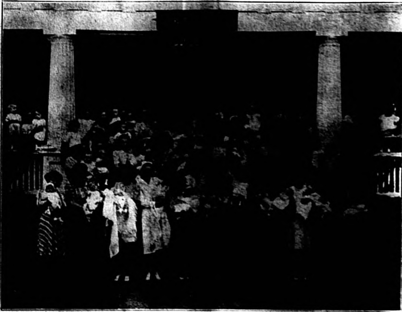
Some 50 babies born in the Fernald-Laughton Memorial Hospital during the past year had their pictures taken at the annual Florence Nightingale, first woman to organize a group of nurses, and was observed all over the United States.