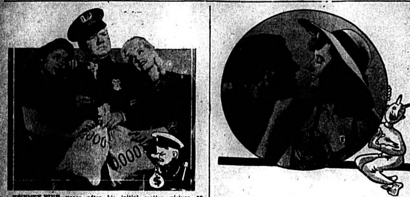
JEAN ARTHUR and Robert Cummings are shown above in a scene from 'The Devil and Miss Jones'...