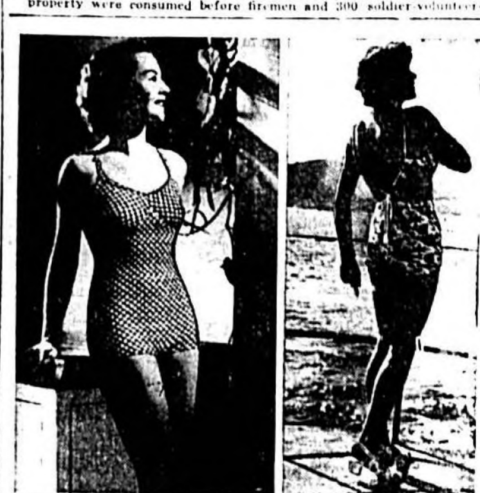
Anticipating Summer Beach Style

The trend in bathing suits this year is toward a more conservative style. The material used will be of a high quality and the design will be simple and elegant.