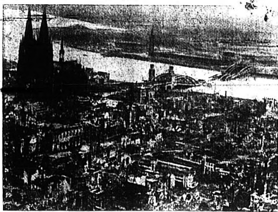
HIGH ABOVE THE WRECKAGE, the smoking of the city of Cologne, Germany, after the fall of the city to Allied forces in the city's history. The ruins of the city in the Rhine after it had been blown up by the Nazis during the war.