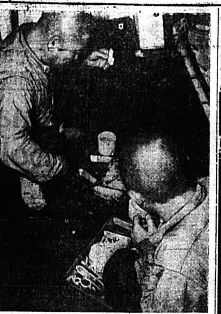
CAPTURED ON TWO JMS, two Jap soldiers get spaghetti instead of their native rice when dinner is served them aboard a Coast Guard invasion ship.

Civilians face scarcer foods in interest of peace. The article discusses the impact of war on food supplies for civilians.