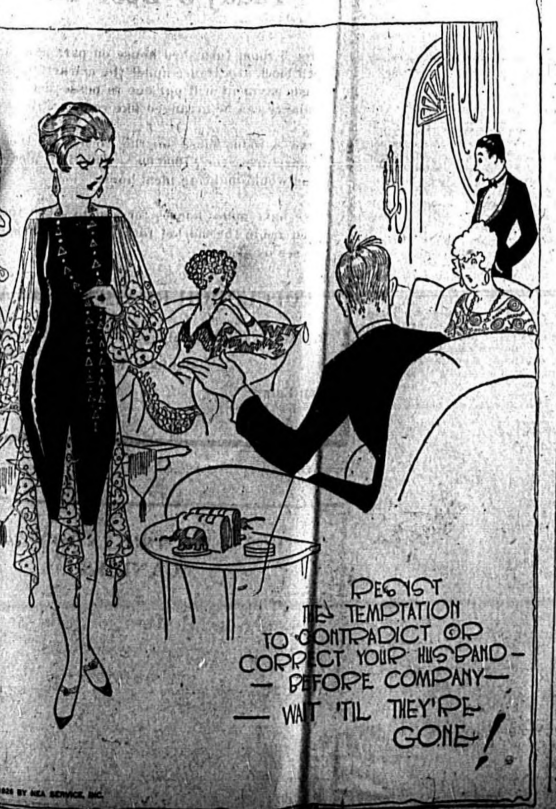
REGISTER TO CONVICTION OR CORRECT YOUR MARRIAGE BEFORE COMPANY - WAIT TIL THEY'RE GONE!