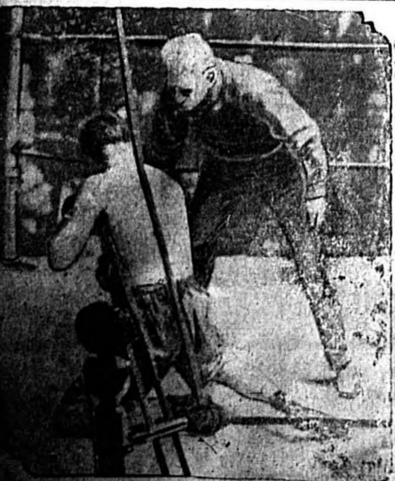
McTigue eagerly helps to rope as referee counts him out of championship hopes in his recent match with Jack London at Madison Square Garden, New York.