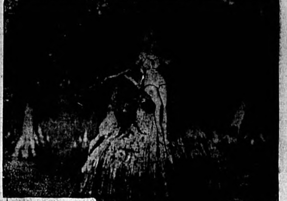
GOING MY WAY? A STRANDED BATHING BEAUTY TIES TO TRUNK A BOAT KID TO CROSS GARDENS, FRONTING THE LAKE.

While having lunch at a nearby restaurant, a million picture pretty Dol Bishop, was nearly left out on the Lake Eloise at Cypress Gardens.