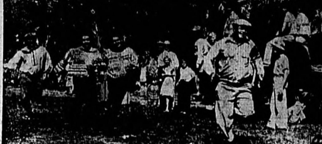
Handicapped by her long, brightly colored dress, the Indian woman in the foreground put on a burst of speed and won the sprints' footrace in the first annual Seminole athletic meet on the Glades county reservation near Brighton, Fla. Below, Seminole fat men are shown displaying their fleetness in any. The plainly dressed fellow (right) defeated his gaily garbed rivals. Five gallons of gasoline was the prize. The celebration was held in celebration of the acquisition of 35,000 acres of Everglades land for use as a cattle range by the Seminoles.