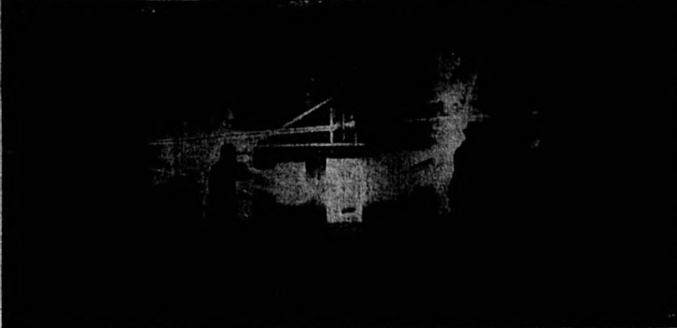
LAWLESS GANGSTERS SEE THE LIGHT, but not for long. Though their feet were drenched, the setting was realistic enough as G-men, using every modern weapon at their command, "rubbed out" a desperate hideout at the marine rifle range, Quantico, Va. Growing stealthily toward the two-story painted canvas structure, federal agents tossed a gas bomb through an upper window, released parachute flares and then laid down a merciless, deafening barrage of machine gun fire which riddled the "gangsters" with tracer bullets and destroyed the "death trap."