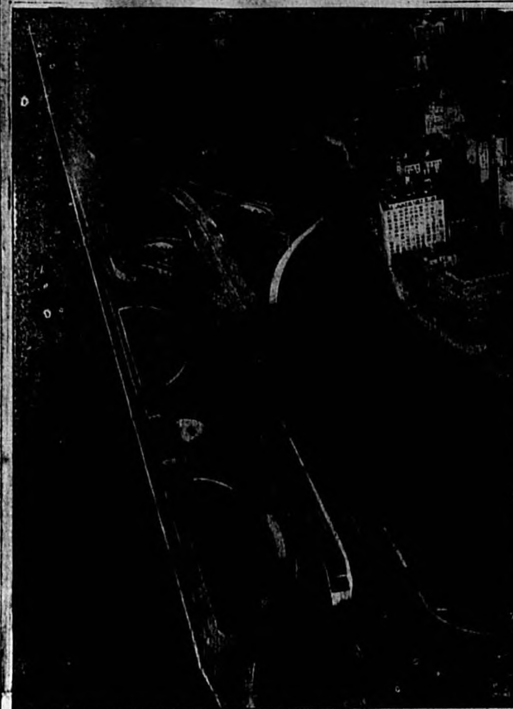
Wide open spaces of the west side of New York City were opened to the public with dedication of the $210,000,000 Hudson River Parkway. Shown in this airview is the modern highway and a section of the 78 acres of recreation area. The link from 72nd street to Dyckman throws open to motorists an express highway extending from downtown New York north up the river almost as far as Poughkeepsie.