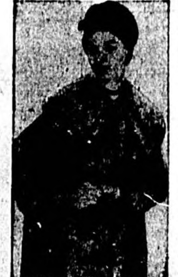
DOUBLE-LAYERED and original in the cape-collared Original's Iris-colored soufflé mohair and wool coat for this coming fall and winter.