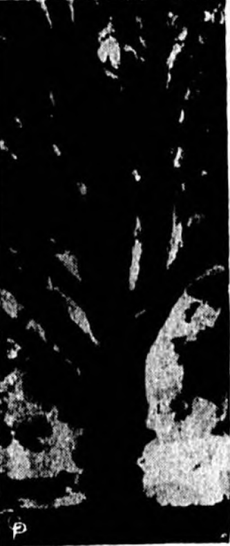
WORK OF ARSONISTS -A fire is shown as it is about to destroy a tree in the San Bernardino National Forest near Forest Home, Calif. The blaze was believed to have been started by arsonists and affected a large wooded area.