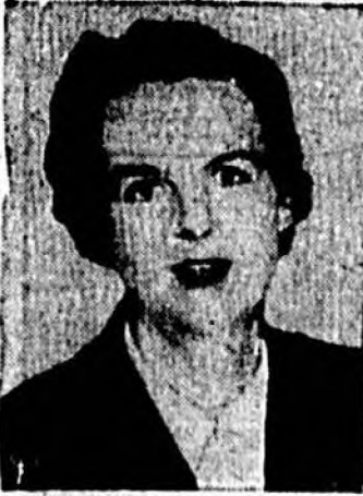
BATHER DE LEFT -Jessica Freeman-Mitford Treuhaff, wife of an attorney in Oakland, Calif., learns in Mexico City, Mexico, that she will not share in the $81,500 estate of her late father, Lord Redcliffe of London. Mrs. Treuhaff reportedly was disinherited for her anti-Fascist political views which differed from her dad's.