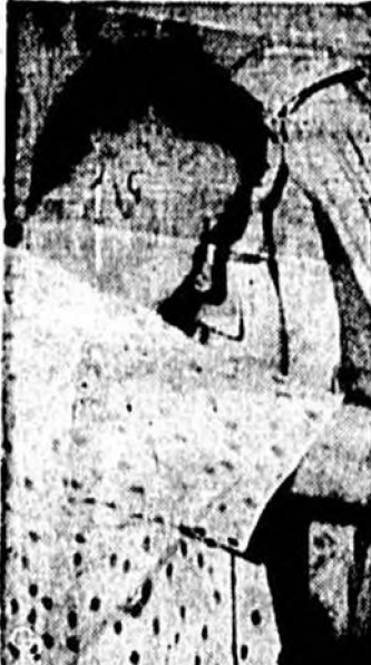
THORN IN RED'S SIDE -Two boys carry a sign declaring their sentiments about Soviet Premier Khrushchev outside the Russian Embassy in New York. They were among 230 Hungarian-American pickets who said they planned to march every day in the hope of annoying the Russians into withdrawing from the 17.N.