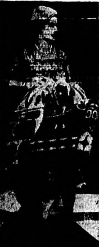
SPECIAL SHOW -Princess Margaret of Great Britain is shown as she watched an Indian program at Courtney, British Columbia. An Indian in the foreground wears native head dress. The Princess is on a one-month tour of Canada.