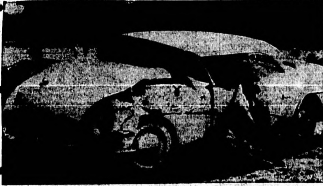
THIS CAR WAS A TOTAL loss following the three car collision Tuesday afternoon. Witnesses reported drag racing caused the accident shortly before 4:30 p.m. two miles west of Sanford on SR 46. Charges of reckless driving willful and wanton were placed against drivers of the two racing cars.