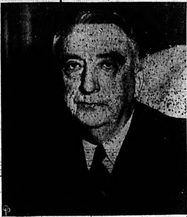
ATTIRED IN HIS official robes, the first time as a new term Chief Justice Fred M. Vinson appears on the bench of the Supreme Court in Washington, for the first time as a new term Chief Justice of the high court.